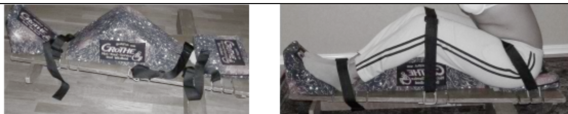
Figure 1: Test-Table-Test Board

2.10 Table 1. describes the tests to be conducted with the test table and the scoring system: